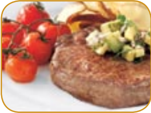
Steak with vegetables

Australians eat red meat in a variety of ways, although the most popular way is as: steak with vegetables or as a meal in casseroles, mince dishes or meatballs. 1