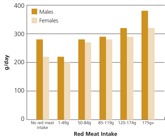
Vegetables at different red meat intake categories - adults